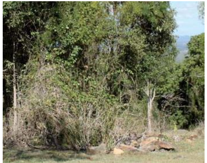
Dry vine scrubs are often now found in small patches with lots of edges, allowing weeds, fire and cattle to enter and degrade the ecosystem.

Patches that have had minimal disturbance are generally weed-free or largely so apart from edges. Lantana is often present along the narrow ecotone between vine forest and eucalypt forest and its presence will promote fire during drier weather when the dry leaves and stems become flammable. Where rainforest patches abut cleared grazing pasture, the highly invasive introduced pasture species Green Panic ( Megathyrsus maximus ) plays a similar role in increasing fire risk. The species tolerates semi-shaded conditions under a broken tree canopy and like Lantana, becomes highly flammable when dry.