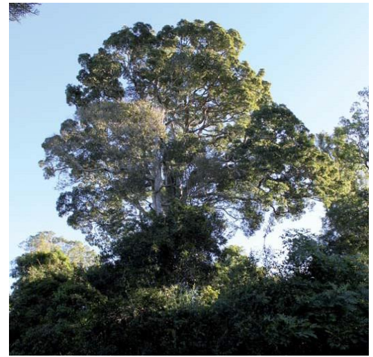
Examples of large, high value timber trees, such as this Crow's Ash ( Flindersia australis ), are now rare in the landscape, and may be absent in current patches of RE 12.8.13 due to earlier clearing and timber extraction.

Fire and grazing are not recommended in dry vine scrub restoration projects due to the potential damage these agents can cause to young plants. Fencing and fire breaks are recommended where there is a risk of damage. Browsing from macropods and possums may also be an issue and tree guards may be needed around palatable species.