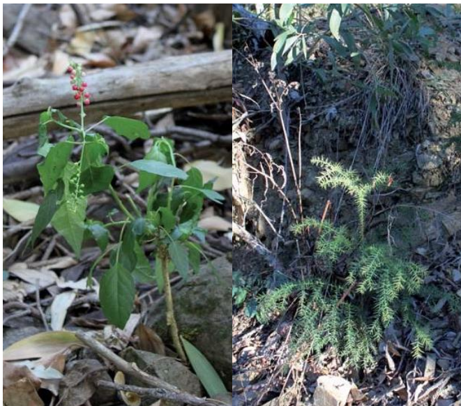
Coral Berry ( Rivina humilis ) is a persistent weed in many dry vine forests as it is able to grow in the shady understorey with little natural competition (above left). Hoop Pine, such as this young plant (above right), do best in open sunny conditions. Such conditions are often created by disturbances.

Hot fires during dry weather will penetrate into vine forest patches for a considerable distance resulting in tree death and promoting post-fire growth of weedy vines and Lantana.